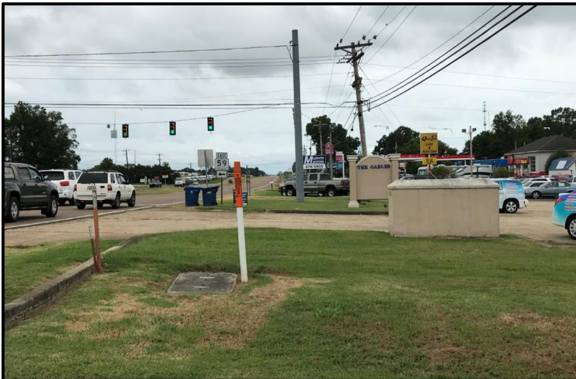
View: North of Office Complex entrance, looking South towards Mueller Brass Intersection