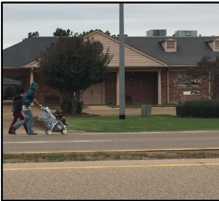
Family with stroller traveling north towards shopping center within project area.