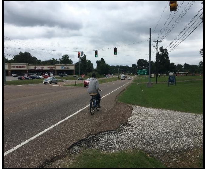
Cyclist traveling north on Highway 51 within proposed project area.