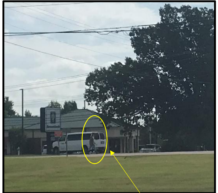
Pedestrian crossing Highway 51 without a crosswalk and very close to oncoming traffic within the proposed project area.