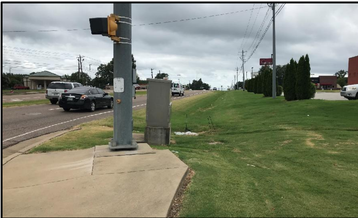
View: Southwest corner of Lanny Bridges Road, looking South. The proposed project will begin where the Phase I project ends.