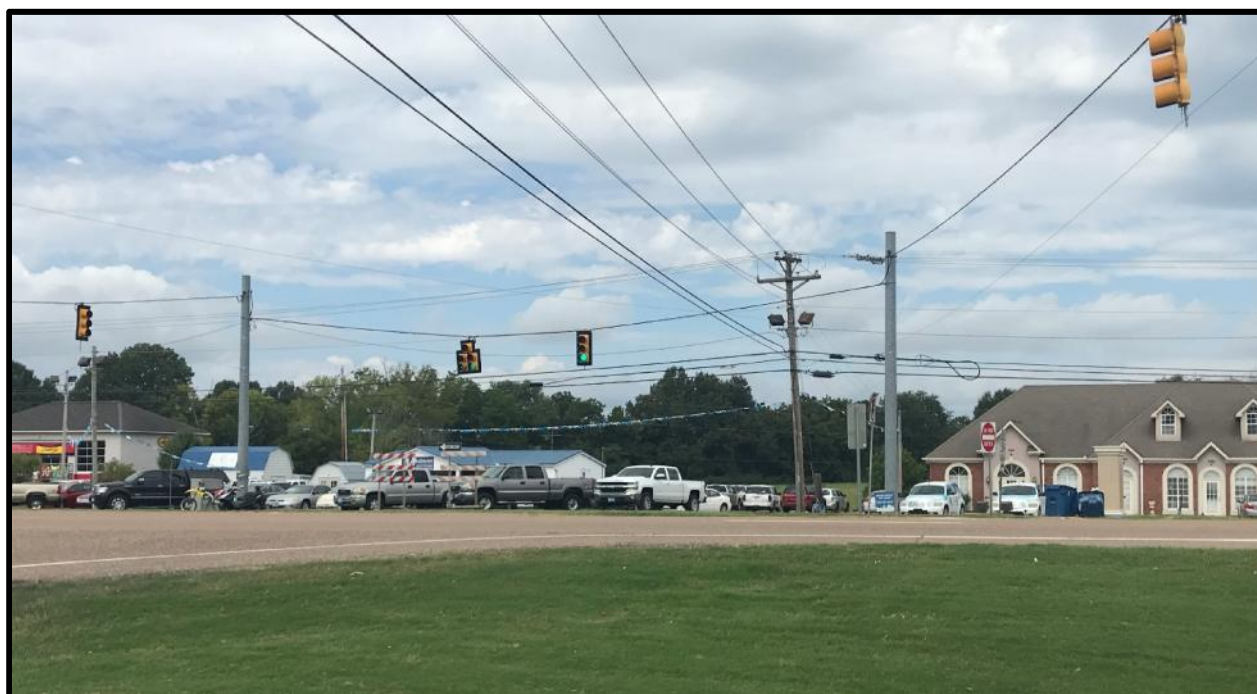
View: In Insurance Agent Parking Lot on Mueller Brass, looking West towards Highway 51 A pedestrian crosswalk will be installed on the northern side of the Mueller Brass intersection so that pedestrians can safely cross Highway 51 to access Mueller Brass Road.