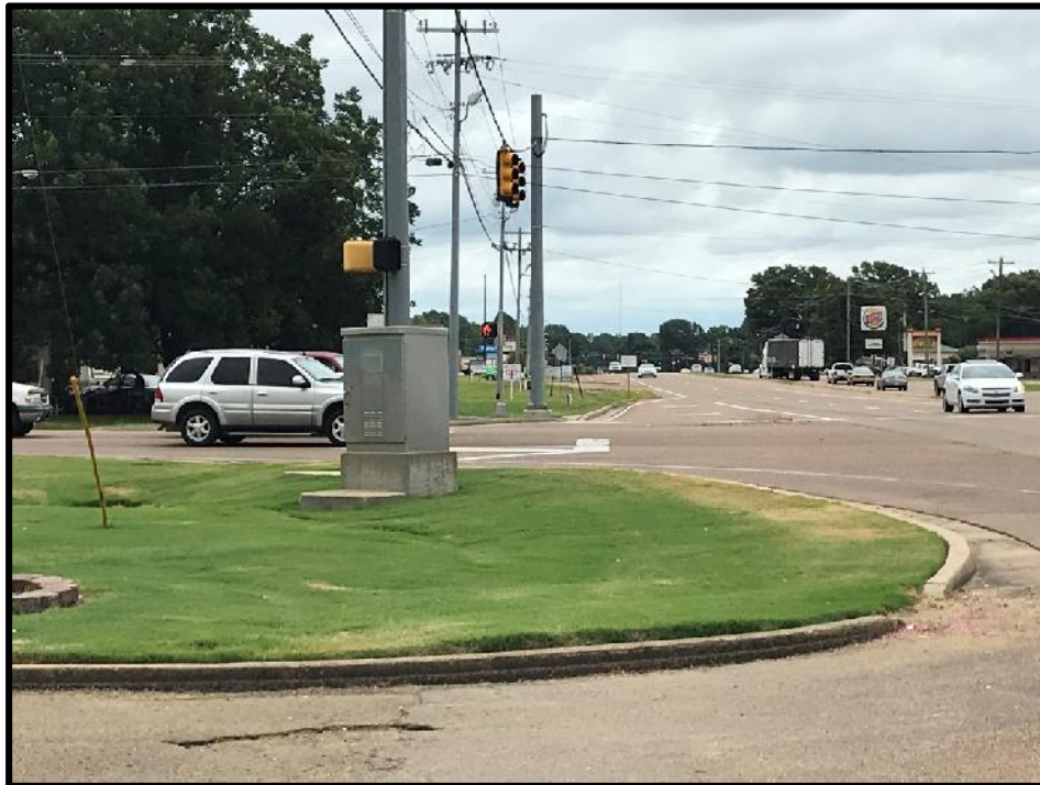
View: At drive of Funeral Home along route, looking north at Holly Grove Rd Intersection. Curb ramps, truncated domes, pavement markings, and audible pedestrian signalization upgrades will be added to improve inspection safety and improve ADA compliance and accessibility.