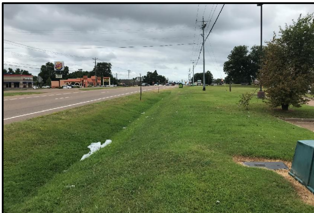
View: At Verizon Store, looking South. The proposed project will construct a 10'-wide multimodal path in existing Right-of-Way. Grass and drainage buffers will be used to create separation between pedestrian and motor vehicle traffic.