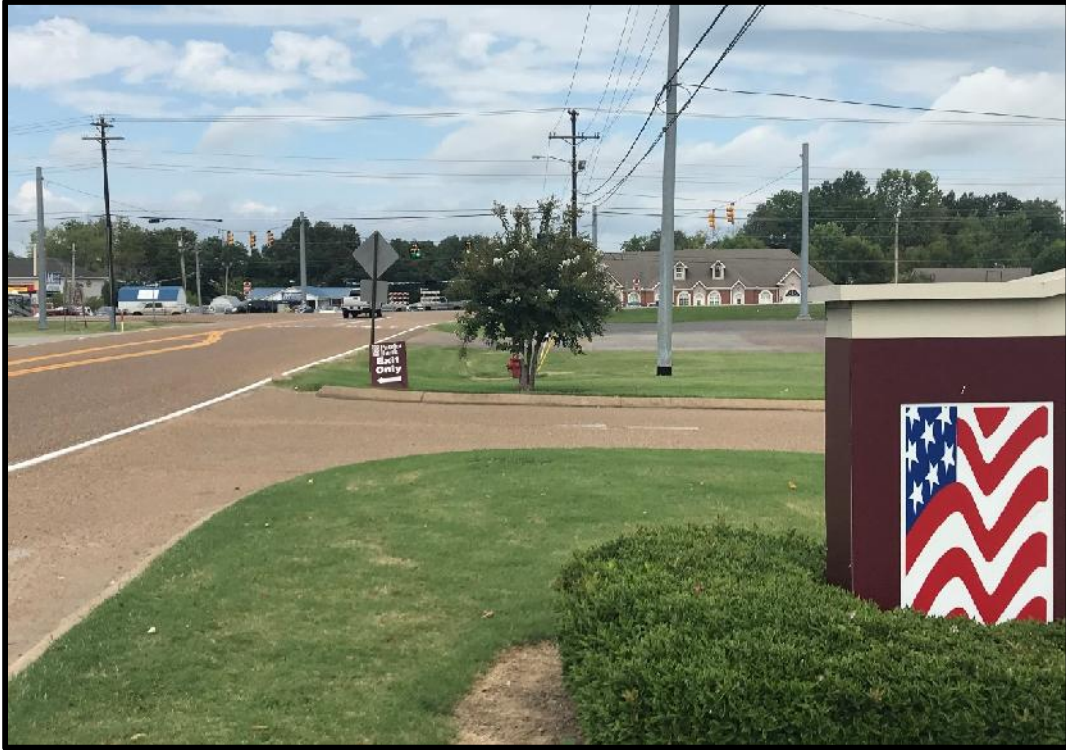
View: Bank Entrance, looking West.

The proposed sidewalk will continue east on the north side of Mueller Brass.