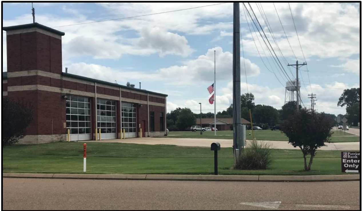
View: Bank entrance, Looking East towards Fire Station.

The proposed sidewalk will continue east on the north side of Mueller Brass.