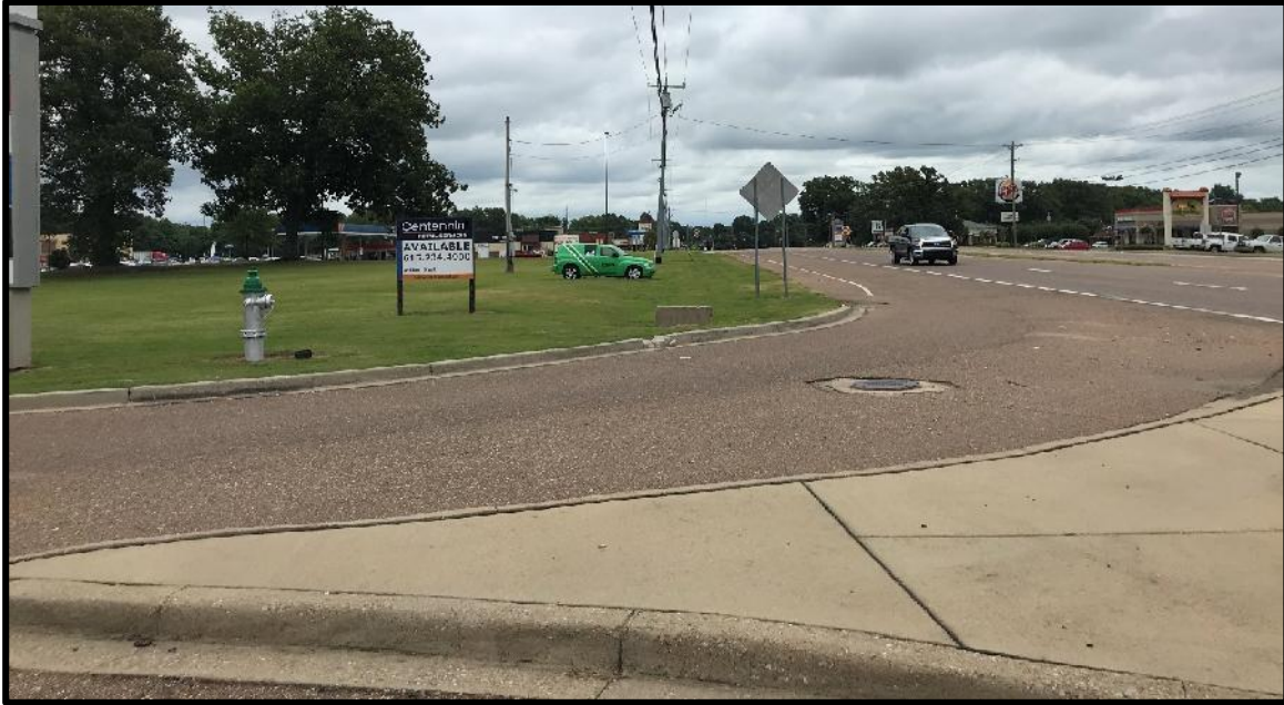
View: At one of the large retail strip entrances along the route, looking north. Driveway crossing improvements, such as pavement markings and truncated domes, will define the path and give right-of-way to pedestrians.