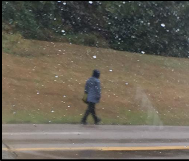
Walker traveling south towards shopping center.